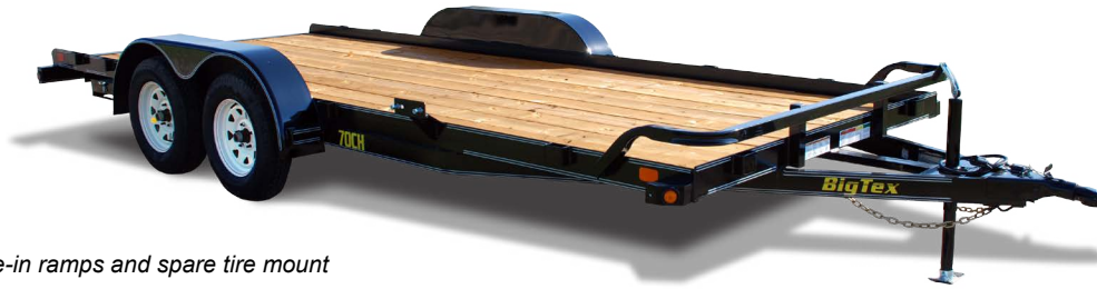
Shown with optional slide-in ramps and spare tire mount